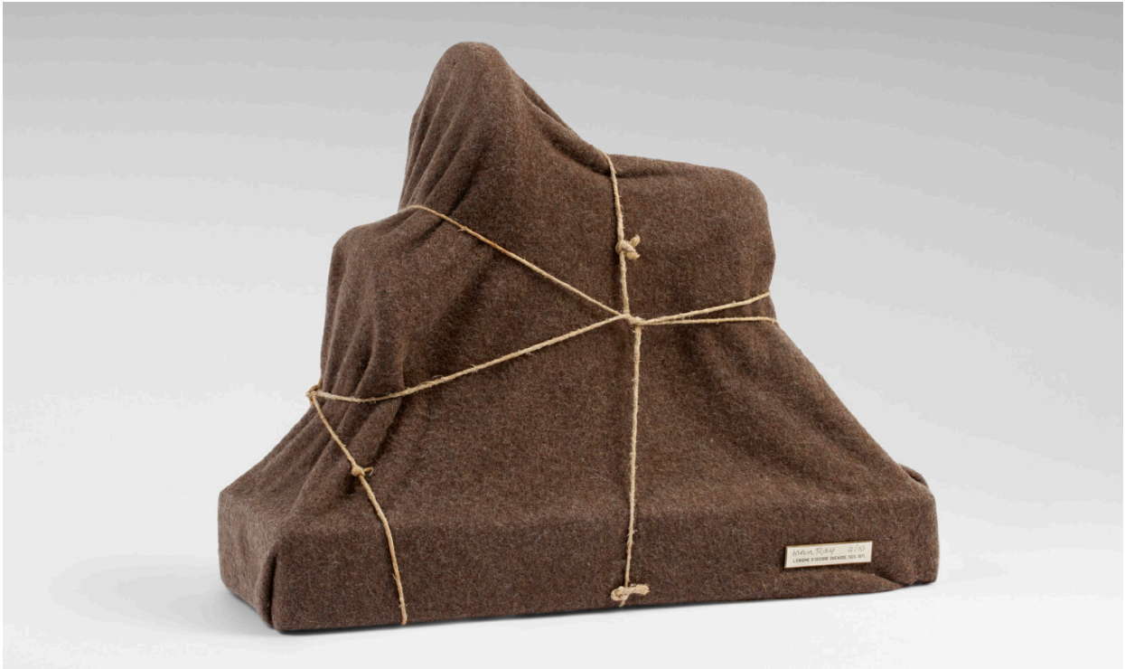
Man Ray (1890-1976), L'Énigme d'Isidore Ducasse , 1971.

On 6 June 2025, Luxembourg + Co., London, will open In Plain Sight , an exhibition of sculptures that assert their spatial presence by means of concealment or invisibility. The display focuses on selected radical experiments in material and conceptual reduction from across the last century. Among the works on display are Man Ray's The Enigma of Isidore Ducasse (1920/1971), Piero Manzoni's Base Magica – Scultura vivente (1961), Bruce McLean's Invisible Sculpture (1969), Gino de Dominicis, Statua (1979), and Maurizio Cattelan, Untitled (Police report of stolen invisible artwork) , (1991).