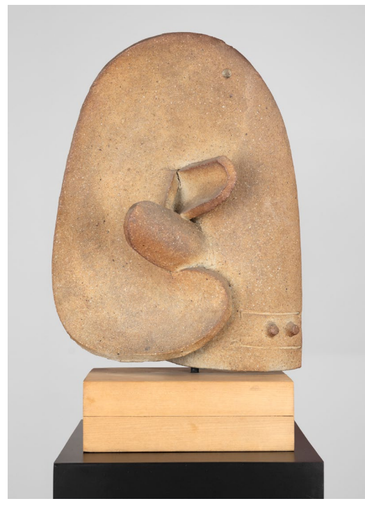
Isamu Noguchi, The Elephant , 1952 © 2024 Estate of Isamu Noguchi / Artists Rights Society (ARS), New York.