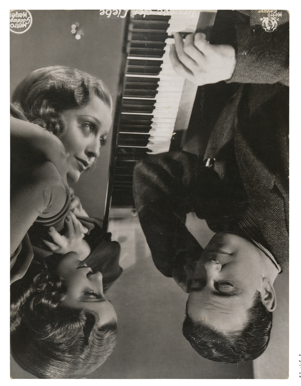
Untitled, 1977 Found photographic film-still, 27 × 19.4 cm. Private Collection.