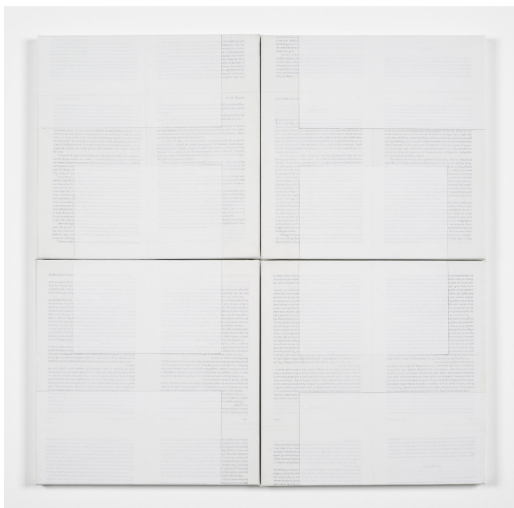
Tim Rollins & K.O.S., THE TIME MACHINE VIII (after H.G. Wells), 2013