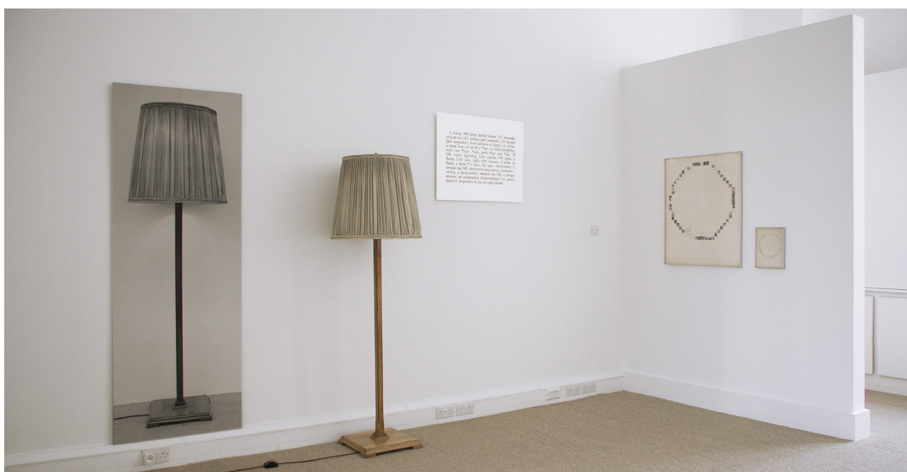
Installation view: Joseph Kosuth, One and Three Lamps, 1965 (left); John Baldessari, Word Chain: Faucet (Ilene's Story), 1975 (right)

Text has played a crucial part in the developments of twentieth century art; from the collaged inclusions of newspapers in Cubist paintings to René Magritte's lessons in the opacity of language, Marcel Duchamp's anti-retinal explorations of art's frontiers and Pop Art's appropriation of advertisement slogans and comic strip. The history of words in art is also in part the history of Conceptualism, reaching an apogee in the dematerialised work of the late '60s when language supplanted images; yet the role of words in art has always been ambiguous, oscillating between making the viewer into a reader and vice versa. The rub of semantics and aesthetics has given rise to a visual poetics that thrives in the space between meaning and making that the exhibition seeks to celebrate in its diversity, involving the viewer in a conversation across time conducted through the silent cacophony of reverberating words.