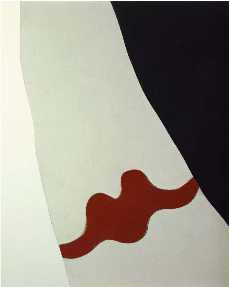
JEAN HANS ARP (1887- 1966) Lèvre, Bouche Painted cardboard and glass. 12.2 x 8.8 in. (31 x 22.5 cm) Executed in 1926

LONDON... Beginning February 5, 2012, Luxembourg & Dayan's London space on Savile Row will be transformed into a fantastical petit salon devoted to Jean Hans Arp, the French-German sculptor, painter, collagist, poet and pioneer of abstract art who was a founding member of the Dada movement. Arp is Art is the first London exhibition to focus exclusively on the artist since his death in 1966. It will feature works from private and museum collections, most of which have not been shown publicly in decades.