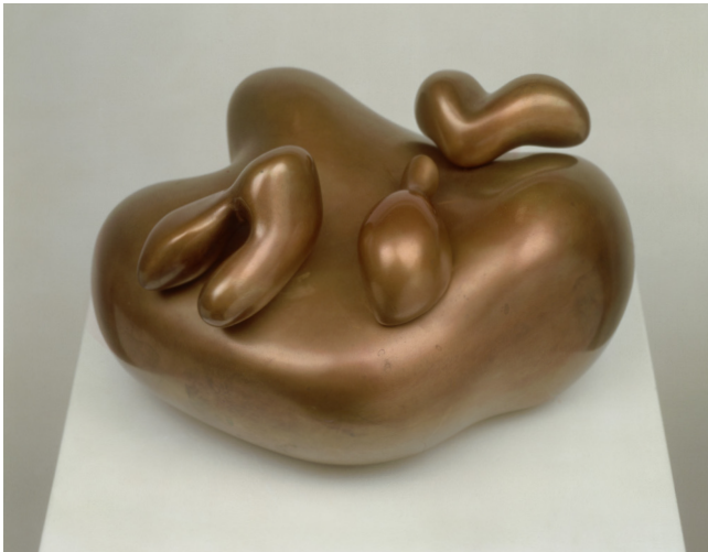
JEAN HANS ARP (1887- 1966) Trois Objets Désagréables Sur Une Figure . Bronze. 14.2 x 10.2 x 7.5 in. (36 x 26 x 19 cm) Conceived in 1930 this work is number 4 from an edition of 5 and was cast by Susse Fondateur in 1971-72

Arp is Art will remain on view through April 13, 2012.