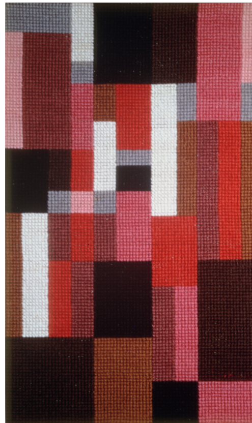
JEAN HANS ARP (1887- 1966) Composition Horizontale – Verticale No. 20 . Embroidery. 15.3 x 9.2 in. (39 x 23.5 cm) Executed in 1917