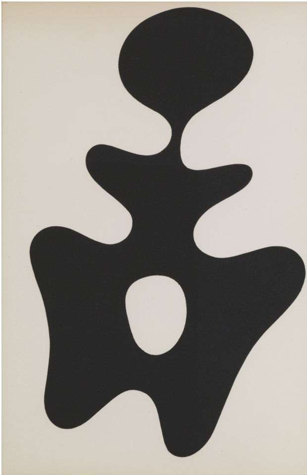
JEAN HANS ARP (1887- 1966). Poupée Nombriil . Black paper collage laid down on paper. 23.2 x 15.4 in. (59 x 39 cm) Executed in 1925.

Arp is Art focuses on the years following the artist's move from Paris to Switzerland.. It was in Zürich in 1916 that Arp joined with such colleagues as Hugo Ball, Marcel Janko, Tristan Tzara and other denizens of the Cabaret Voltaire to launch Dada. One of the first large-scale movements to translate art into provocative action, Dada produced some of the most antibourgeois, antirational, anarchic, playful works to come out of the 20th century.